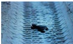
Hatchling traversing over tire track

The over-arching biological goal of the HCP is to provide a net benefit to both sea turtles and AIBM throughout the life of the ITP. The programs and policies contained in the HCP will improve the County's protected species management on the beaches relative to practices currently in place. The Plan contains measures that will be implemented to minimize the potential for impacts to sea turtles and the AIBM causally related to vehicular access to the beach under the County's authority.