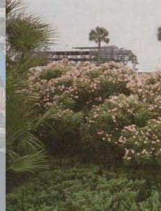
Nerium oleander (Petite) Oleander

Uses: Accent, massing, foreground, ground cover, shrub, pots