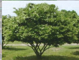
Ligustrum lucidum Patio tree Ligustrum Patio Tree

Uses: Specimen, accent, street, perimeter, corner