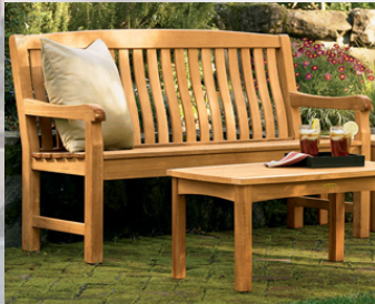
'Devon' Bench by Smith & Hawken www.smithandhawken.com