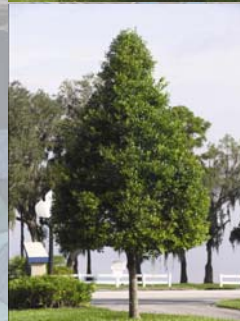
Ilex x attenuata 'East Palatka' East Palatka Holly

Uses: Specimen, accent, shade, street, perimeter, corner, screening