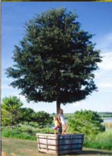
Quercus virginiana Live Oak

Uses: Specimen, accent, shade, street, framing, perimeter, corner, screening