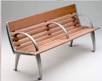
Town Center Standard Bench 'Austin' by Landscape Forms www.landscapeforms.com