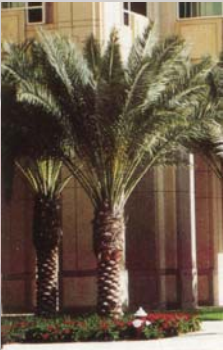
Phoenix dactylifera 'Medjool' Medjool Date Palm

Uses: Specimen, accent, shade, street, perimeter