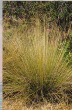
Muhlenbergia capillaris Muhly Grass

Uses: Massing, foreground, ground cover, shrub