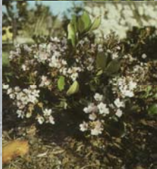
Raphiolepis indica Indian Hawthorn

Uses: Massing, foreground, ground cover, shrub