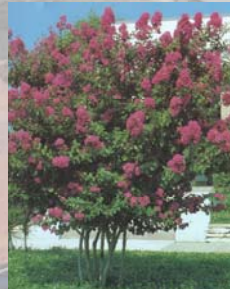
Lagerstroemia indica spp. Crepe Myrtle

Uses: Specimen, accent, street, perimeter, corner