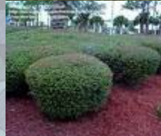
Ilex vomitoria 'Schillings' Dwarf Yaupon Holly

Uses: Massing, foreground, ground cover, shrub, pots