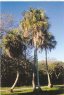
Sabal palmetto Cabbage Palm

Uses: Specimen, accent, shade, street, perimeter