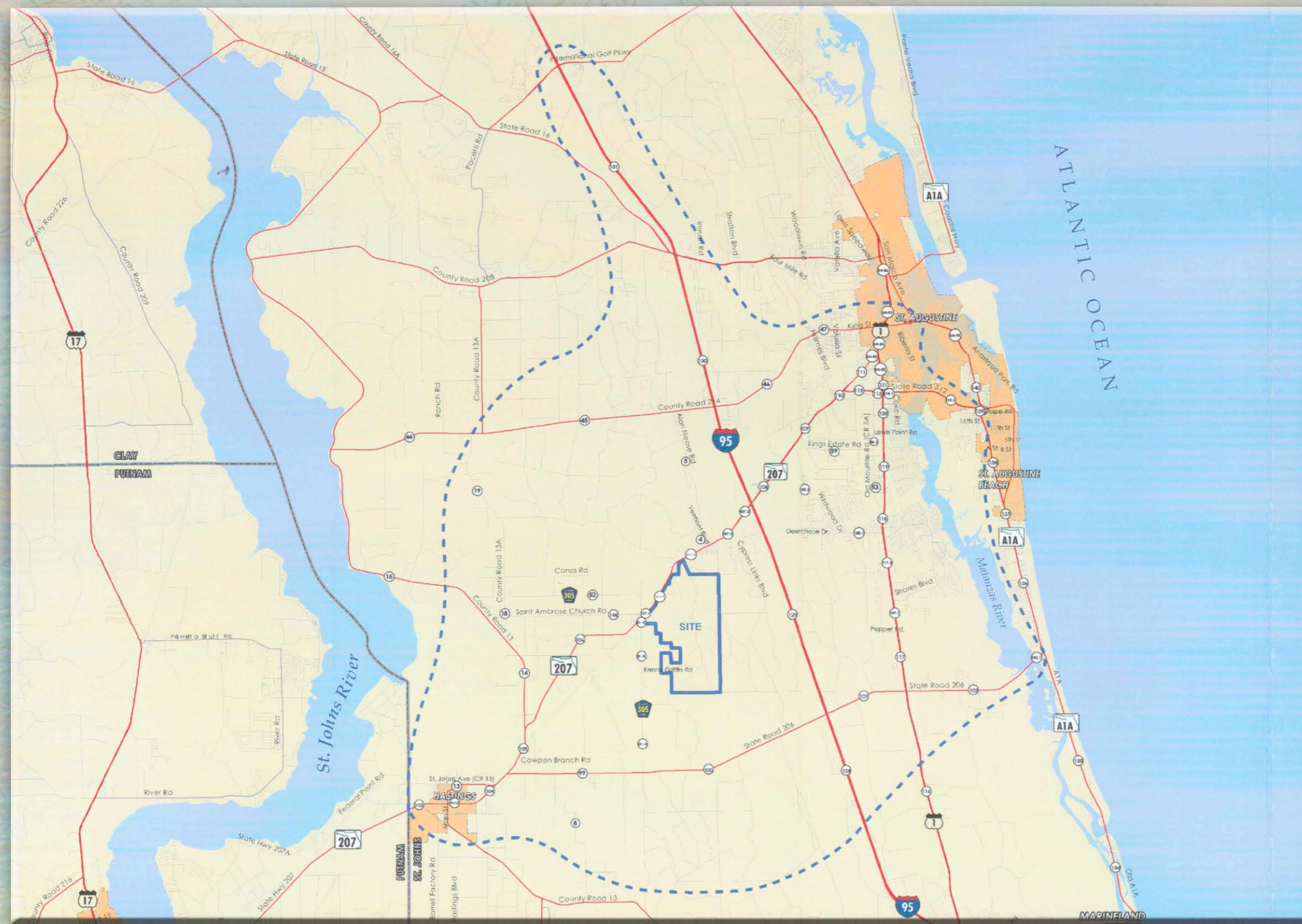
Figure 21-1 Traffic Study Area with Link Numbers