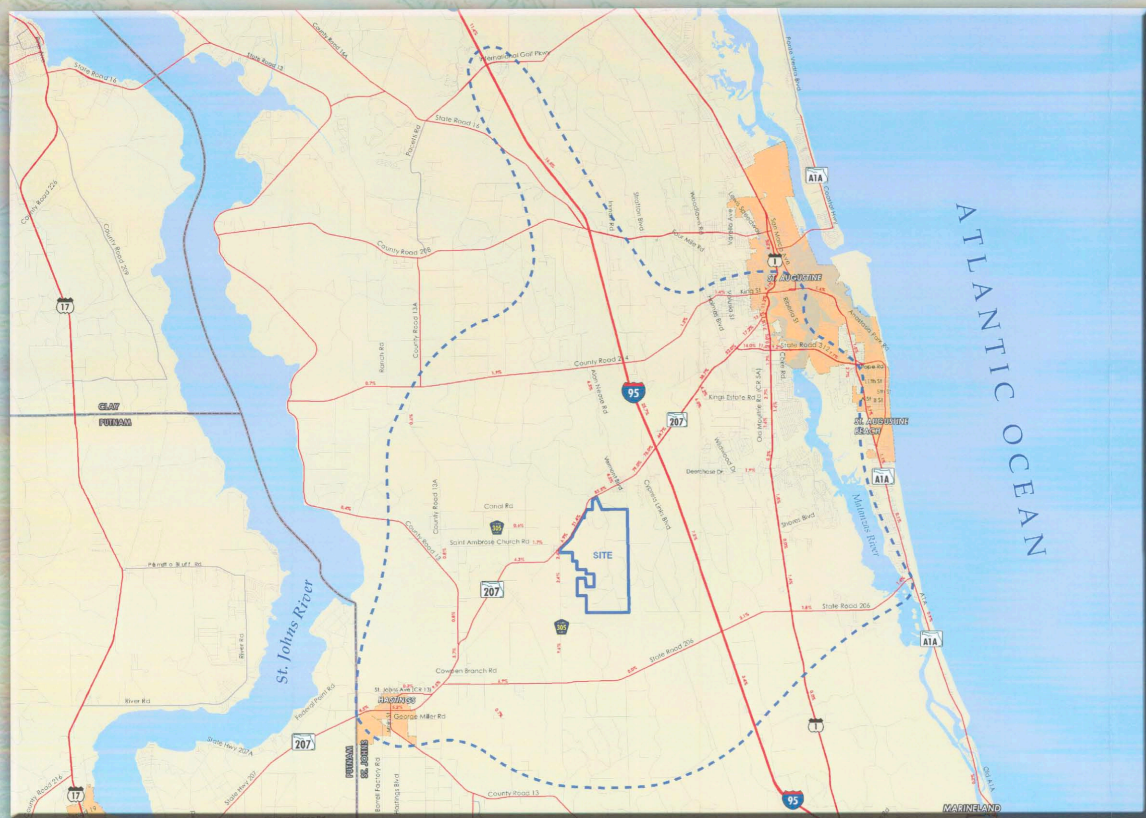
Figure 21-3 Traffic Assignment (Phase I)