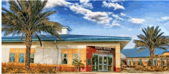
Southwoods Elementary School 4750 State Road 206 West Elkton, FL 32033

St. Johns County has established two Pet Friendly Shelters for emergency situations that require citizens to evacuate their homes. The following shelters will be the ONLY shelters that will accept you and your pet during an evacuation. Please listen to television and radio when an evacuation is ordered to determine which shelters are open because all shelters may not be open.