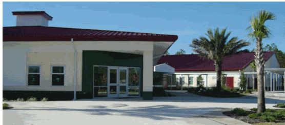
Timberlin Creek Elementary School 555 Pine Tree Lane St. Augustine, FL 32092

Pets brought to the Pet Friendly Shelter are required to have the following: