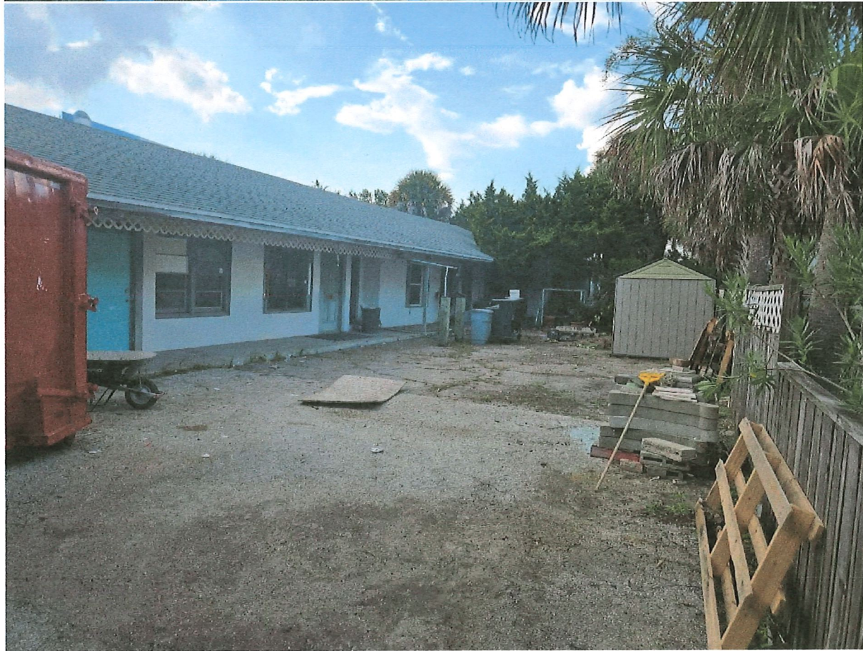
Current Shingle Roof @ 176 Vilano rd