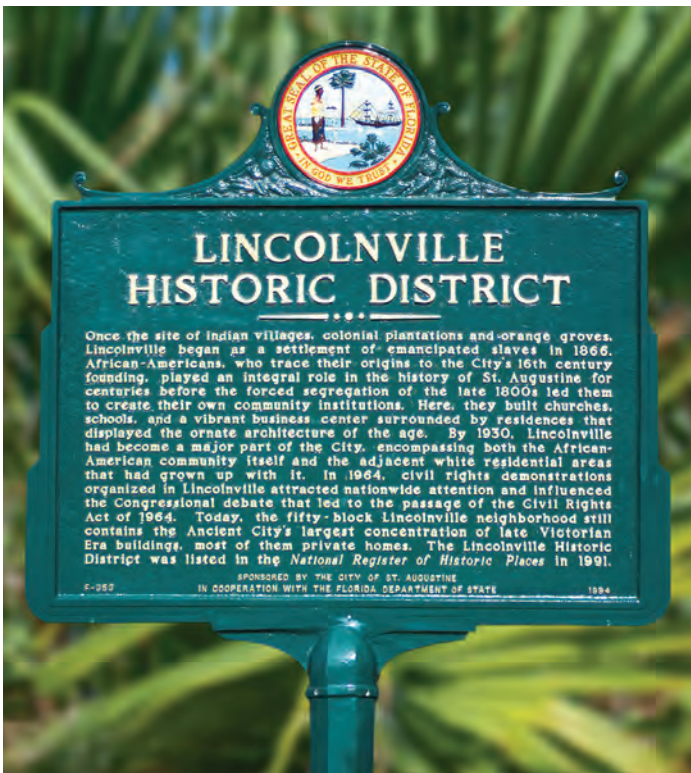
Founded in 1866 by former slaves, the Lincolnville Historic District is St. Augustine's most prominent historically black neighborhood.