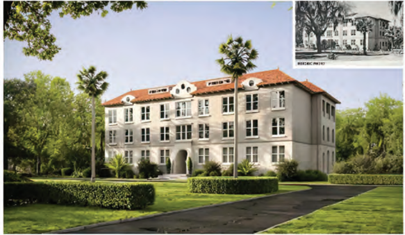
Artist rendering of one of the buildings that will be on the expansive 17 acre campus