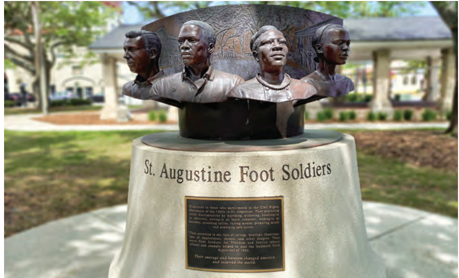
The St. Augustine Foot Soldiers Monument in downtown St. Augustine, unveiled May 14, 2011, pays tribute to those who participated in demonstrations that helped lead to passage of the 1964 Civil Rights Act.

• Current efforts to help further the mission of the Florida Black History Museum have secured $6 million.