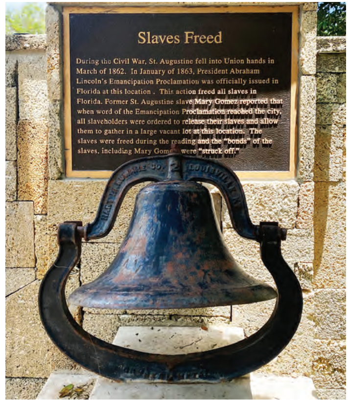
Emancipation Freedom bell commemorating one of the readings of the Emancipation Proclamation in St. Augustine in 1863.