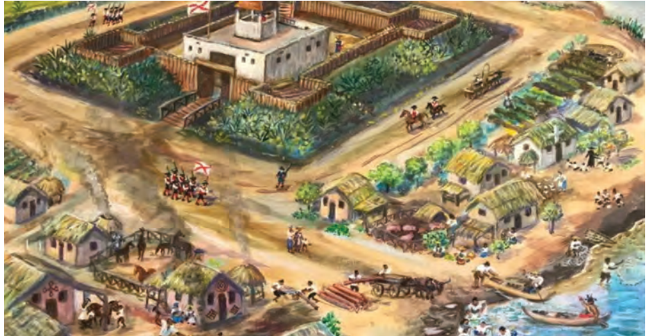
An artist's interpretation of how Fort Mose looked. https://news.wjct.org/first-coast/2022-03-03/fort-mose-and-other-african-american-sites-approved-for-historigrants

• In 1738, Fort Mose became North America’s first free Black settlement. This National Historic Landmark, part of the National Underground Railroad Network to Freedom, is a designated UNESCO Site of Memory for the Routes of Enslaved Peoples Project.