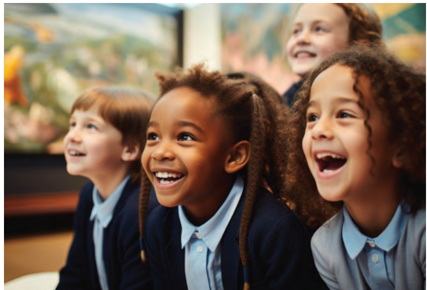
St. Johns County School District ranks among Florida’s best, with a 94% graduation rate and rich educational programs that draw students to its unique historic sites.

• The county features five higher education institutions, with five more within a 40-mile radius, including two of Florida’s four HBCUs. Academic partnerships with the University of Florida bring undergraduate and graduate students to the area to experience our heritage and gain valuable experience through academic internships.