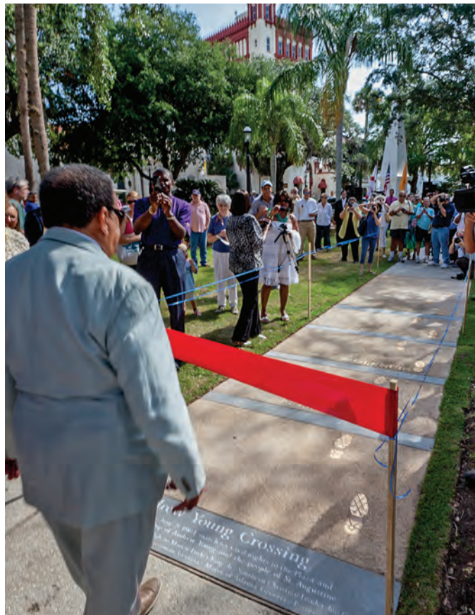
On Saturday, June 11, 2011, Andrew Young stepped onto a sidewalk monument commemorating the historic June 9, 1964 march for Civil Rights in St. Augustine, during its dedication ceremony at the Plaza de la Constitucion.

May 12, 2024 Washington Post article https://www.washingtonpost.com/history/2024/05/12/fort-mose-reconstruction-black-settlement/